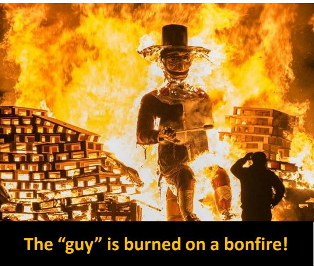
The “guy” is burned on a bonfire!

Potatoes are baked in the bonfire. They are VERY tasty!