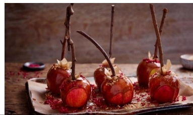
Delicious cinder toffee, and toffee apples.